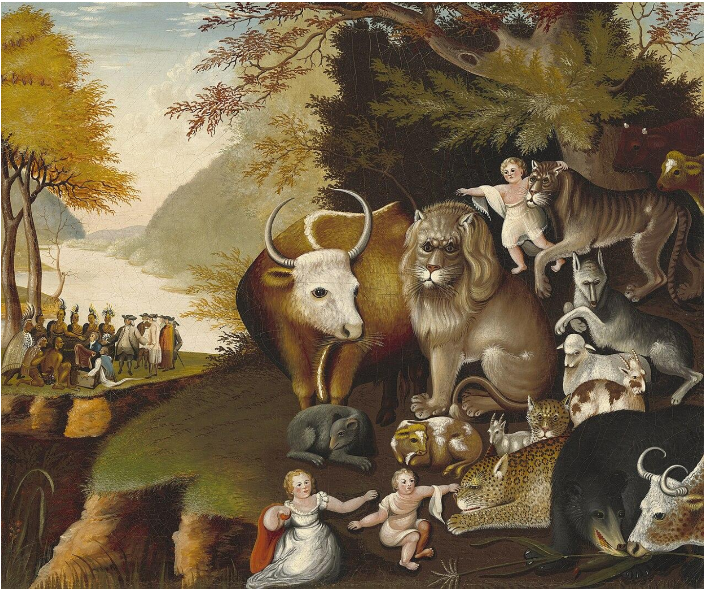
Edward Hicks, Peaceable Kingdom, c. 1834