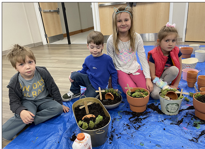
Gods Kids Club made Ressurrection Gardens.