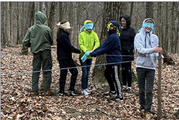
Youth group on the Blind Maze and Low Ropes course at Camp Manidokan