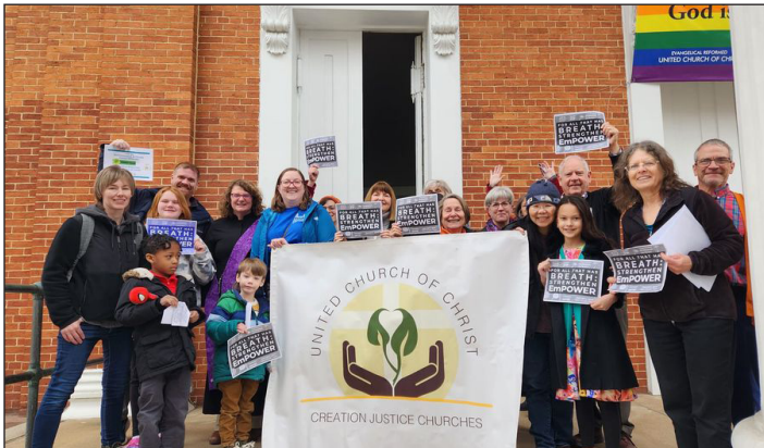
ERUCC photo support for passage of the EMPOWER Maryland legislation!

The Chimes Service and Learning Group will meet Thursday, April 13 in the North Room at 11:00 a.m.