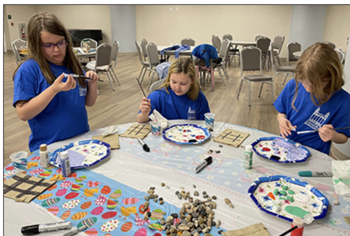
Painting rocks to be used as game pieces.

For anyone who has not done of recent safe church trainings, we will schedule one before VBS