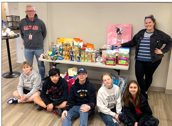
The Confirmands held a movie day to support Frederick County Animal Control.